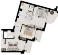
Plan3-Fuente Lirios-apartments-Benahavis-2bed-VIV 1-8-Jul 25