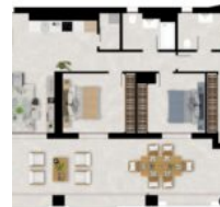
Plan5-Fuente Lirios-apartments-Benahavis-3bed-VIV 2-10