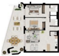
Plan2-Fuente Lirios-apartments-Benahavis-2bed-VIV 1-2