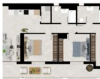
Plan6.1-Fuente Lirios-apartments-Benahavis-3bed-VIV 2-11