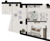
Plan1-Fuente Lirios-apartments-Benahavis-2bed-VIV 1-1