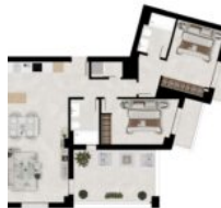
Plan4-Fuente Lirios-apartments-Benahavis-2bed-VIV 1-13