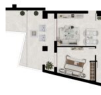
Plan1-Fuente Lirios-apartments-Benahavis-1bed-VIV 1-1