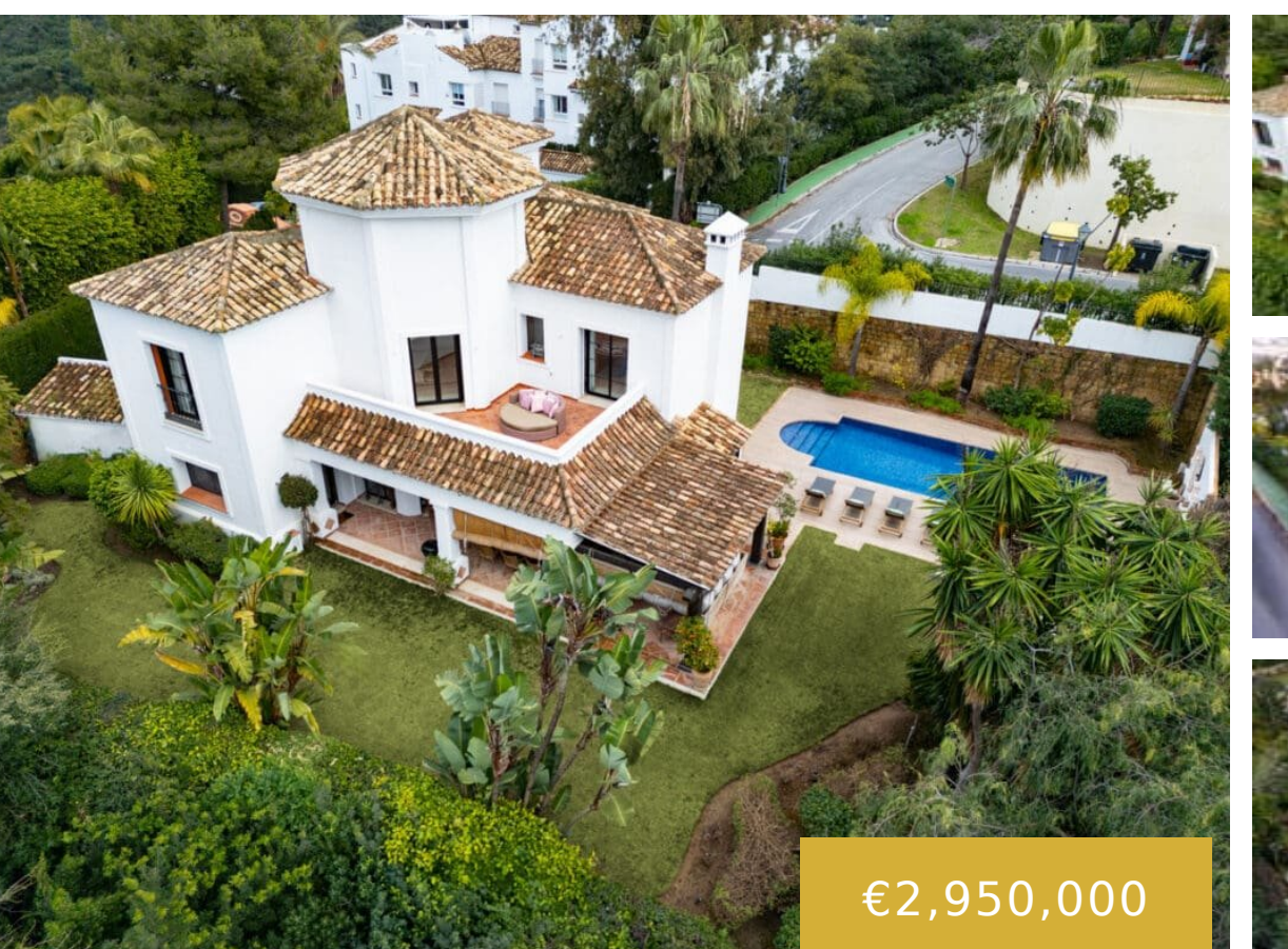
LA QUINTA https://benahaviscollection.com